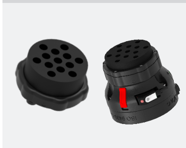
Suction plate with 10 and 20 mm foam with flow reduction