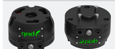
Pump unit with integrated ejector