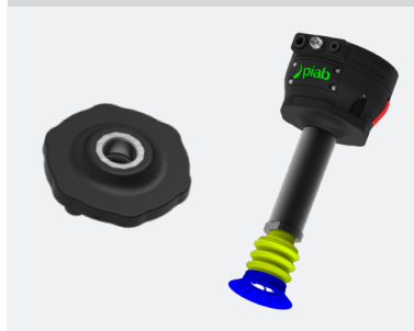
Suction cup holder 3/8" female