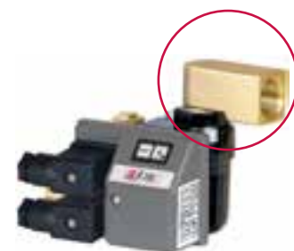
KAPTIV-MD-AL equipped with side inlet adapter