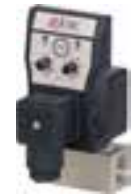
Stainless steel FLUIDRAIN

For applications up to 40 bar - stainless steel valve