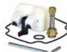
Service kit for MAGY drains