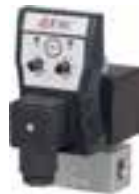
80 bar stainless steel FLUIDRAIN

For applications up to 250 bar - stainless steel valve