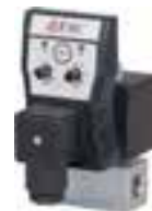
400 bar stainless steel FLUIDRAIN

For low voltage versions - Please contact us