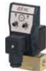
FLUIDRAIN 40 bar

For applications up to 80 bar - brass valve