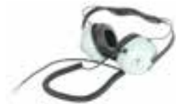
Deluxe hard-Hat headset for LOCATOR