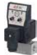
40 bar stainless steel FLUIDRAIN

For applications up to 80 bar - stainless steel valve