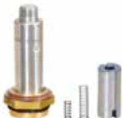
Valve service kit

See page 14 for additional timer drain service parts