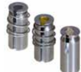
Various seal options