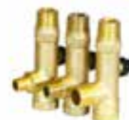
Ball valve strainers