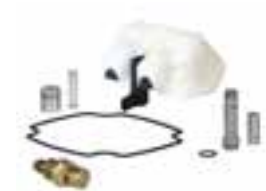
Service kit for NUFORS-CR