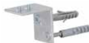
Wall mounting bracket