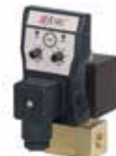
FLUIDRAIN 80 bar