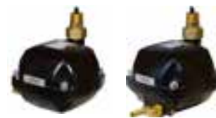
MAGY-UL including anti-airlock adapter, with or without test button