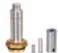
Valve service kit

See page 14 for additional timer drain service parts