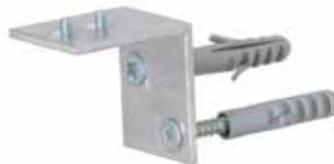
Wall mounting bracket