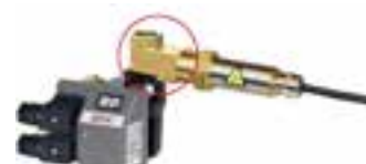
KAPTIV-MD-AL equipped with DRAIN HEATER 'T' adapter and DRAIN HEATER