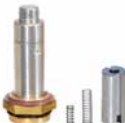
Valve service kit