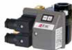
KAPTIV-MD-AL with alarm feature