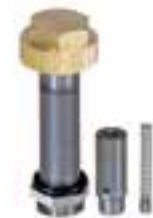
Valve service kit