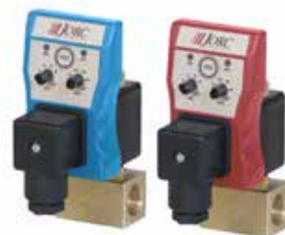
Private labelling options and various colors available