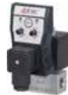
250 bar stainless steel FLUIDRAIN

For applications up to 350 bar - stainless steel valve