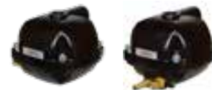
MAGY with or without test button