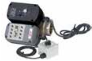
2" AIR-SAVER with remote switch